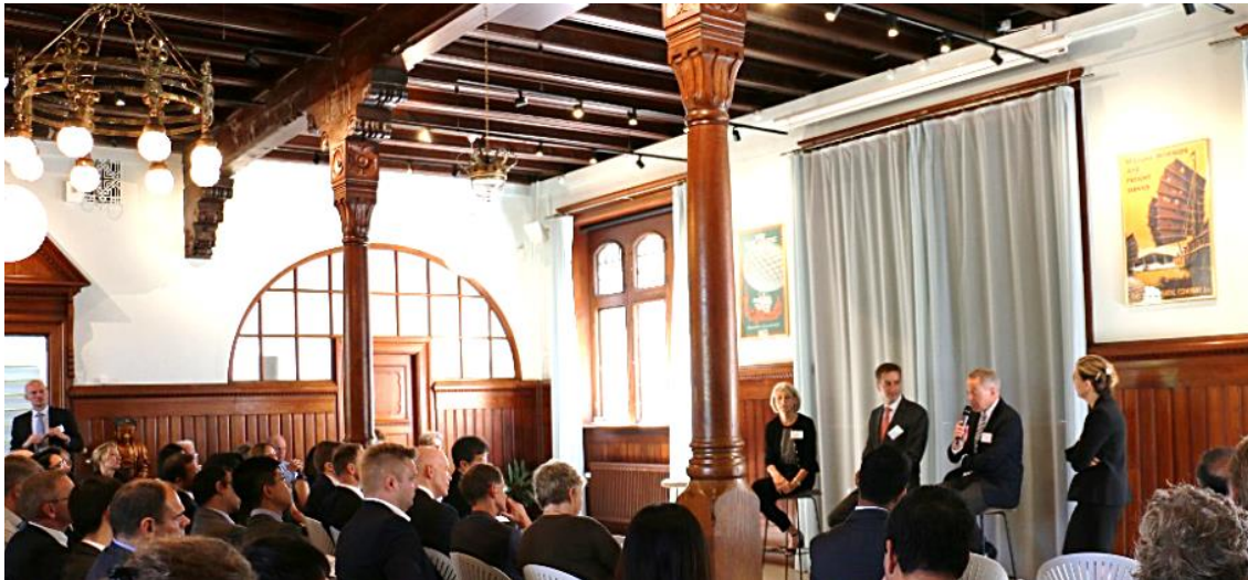
23 August: "Strategic Asian Partnerships" co-hosted with the Danish Ministry of Foreign Affairs