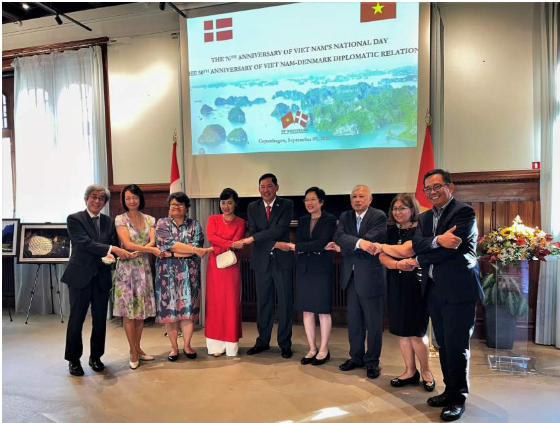
The Ambassadors from Japan, Indonesia, Vietnam, Thailand and the Philippines with their spouses in this pose of friendship and solidarity at the Vietnamese National Day reception.